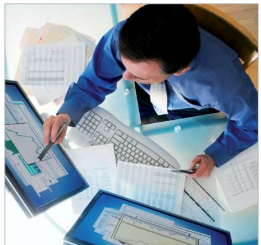
Monitor, analyze and focus the ads with broadcasting